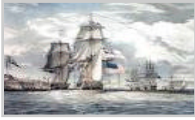
An artist's rendering of the U.S.S. Scorpion, part of Joshua Barney's Chesapeake Bay Flotilla in the War of 1812, which was scuttled to prevent the approaching British Army from commandeering his vessels on August 22, 1814